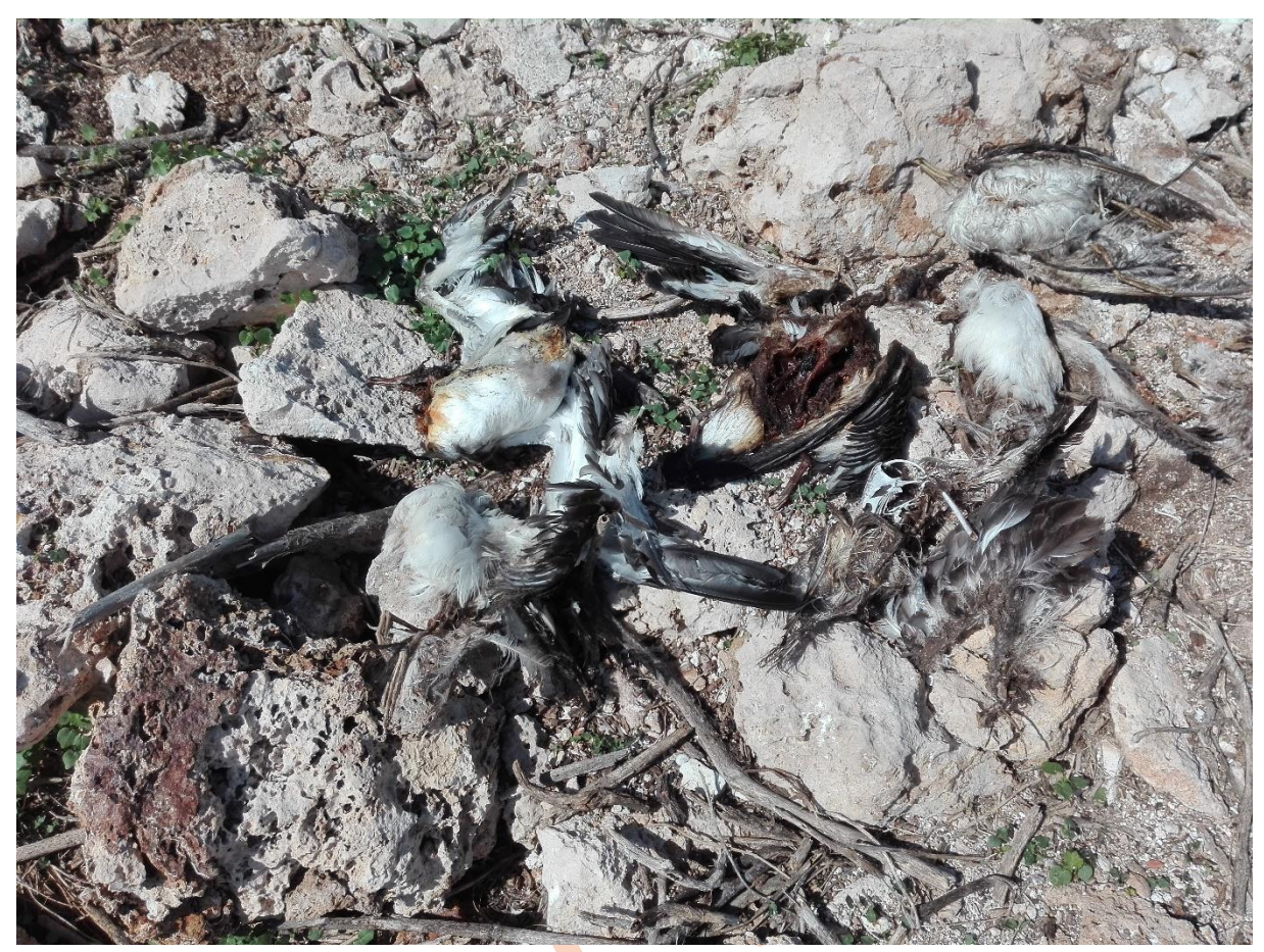
Figure 2. Some of the Shearwater chicks killed by Yellow-legged Gulls before fledging (early October 2018).