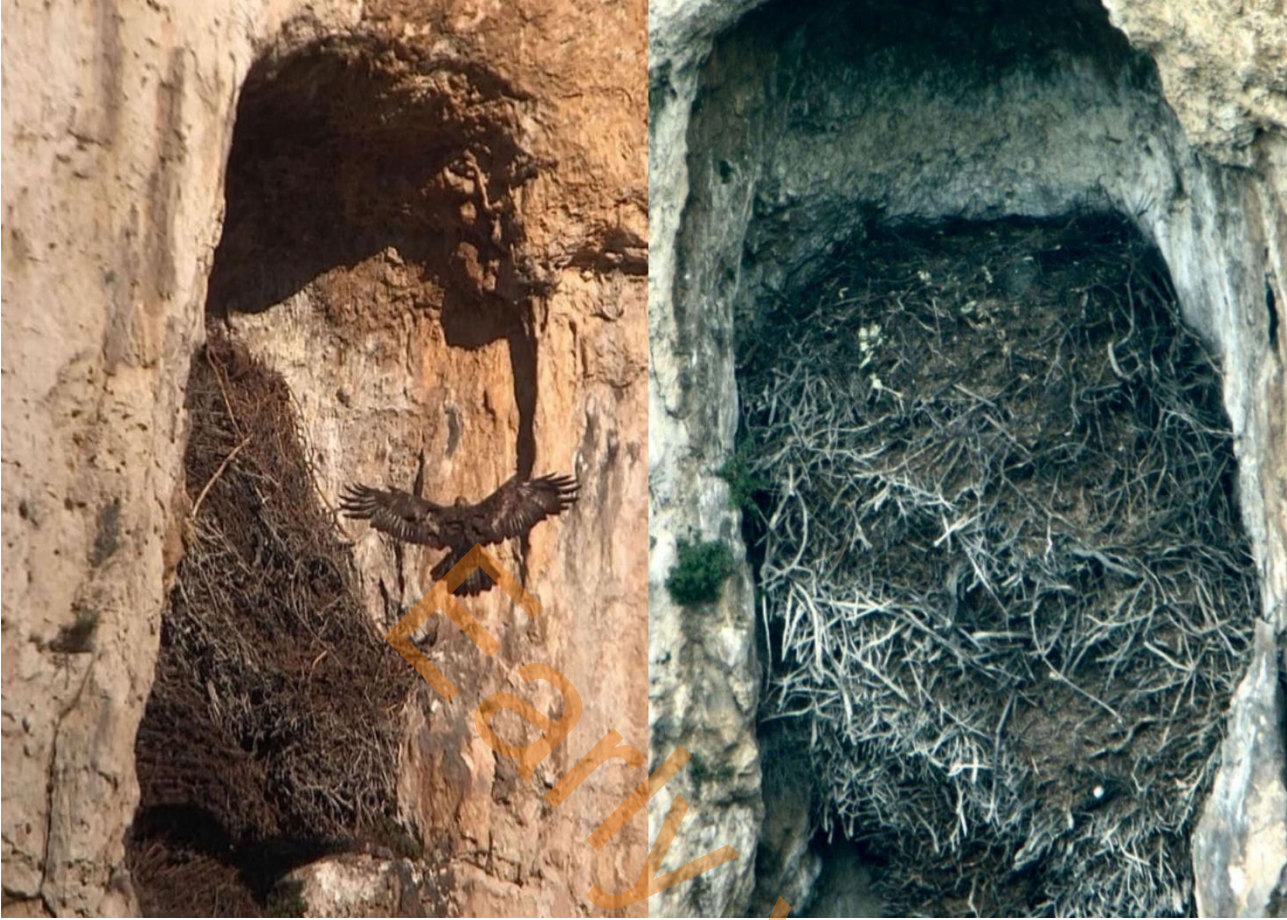
Fig. 4. Furlo Gorge (M. Paganuccio), historical nest-F5 (2014 and 2007)