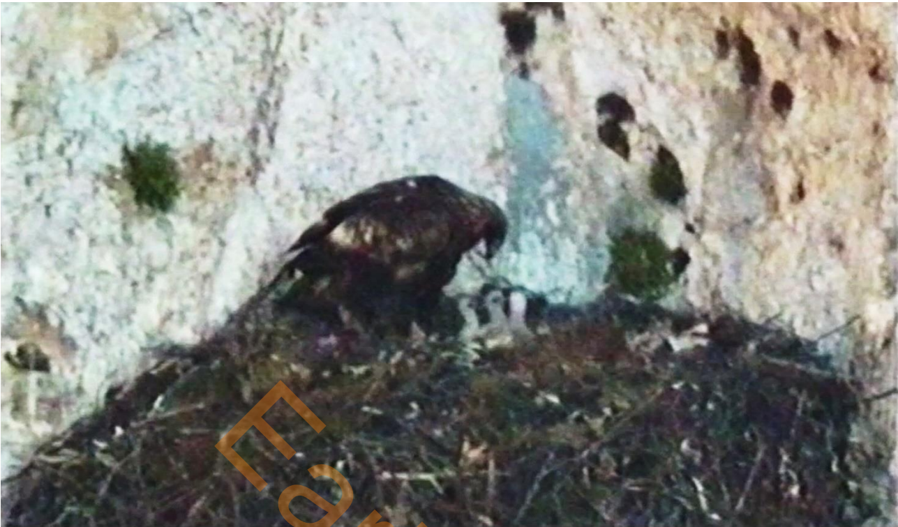
Fig. 3. Brood with three chicks (Furlo Gorge, 1997)