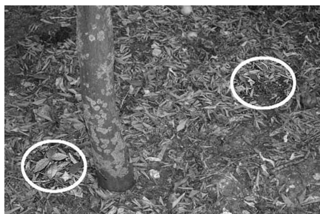
Figure 2. Two Holm Oak seedlings close to a lemon tree in a cultivated orchard in Fondo Micciulla, Palermo, Italy.