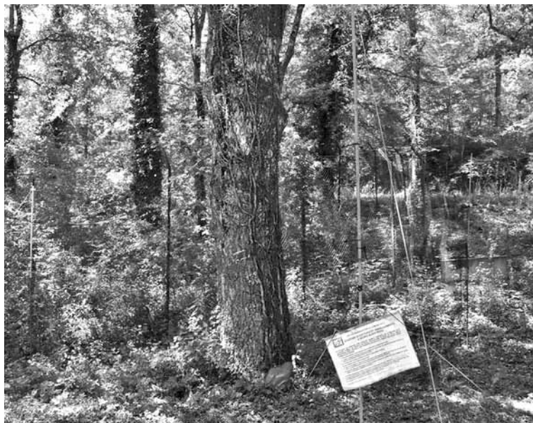
Figure 2. Mist-net disposal; at the base of the tree an acoustic playback is placed and the tree is surrounded by three nets. A close-up of the panel warning hikers of ongoing activity.

sign) placed at the vertices of a triangle whose centre overlapped with the treecreeper's sampling point; for the sampling methods we followed the National Forest Inventory approach (Tabacchi et al. 2006). We measured and classified (diameter at breast height, tree height, species and development stage) trees with diameter \geq 2.5 cm. We derived nine variables, commonly used in forest-wildlife studies: